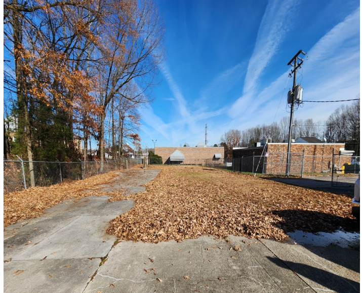
Fenced in area

For more information, please contact Specter Properties, Inc.: