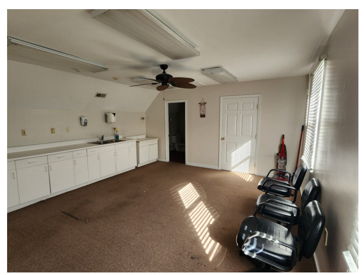
2nd floor side building

For more information, please contact Specter Properties, Inc.: