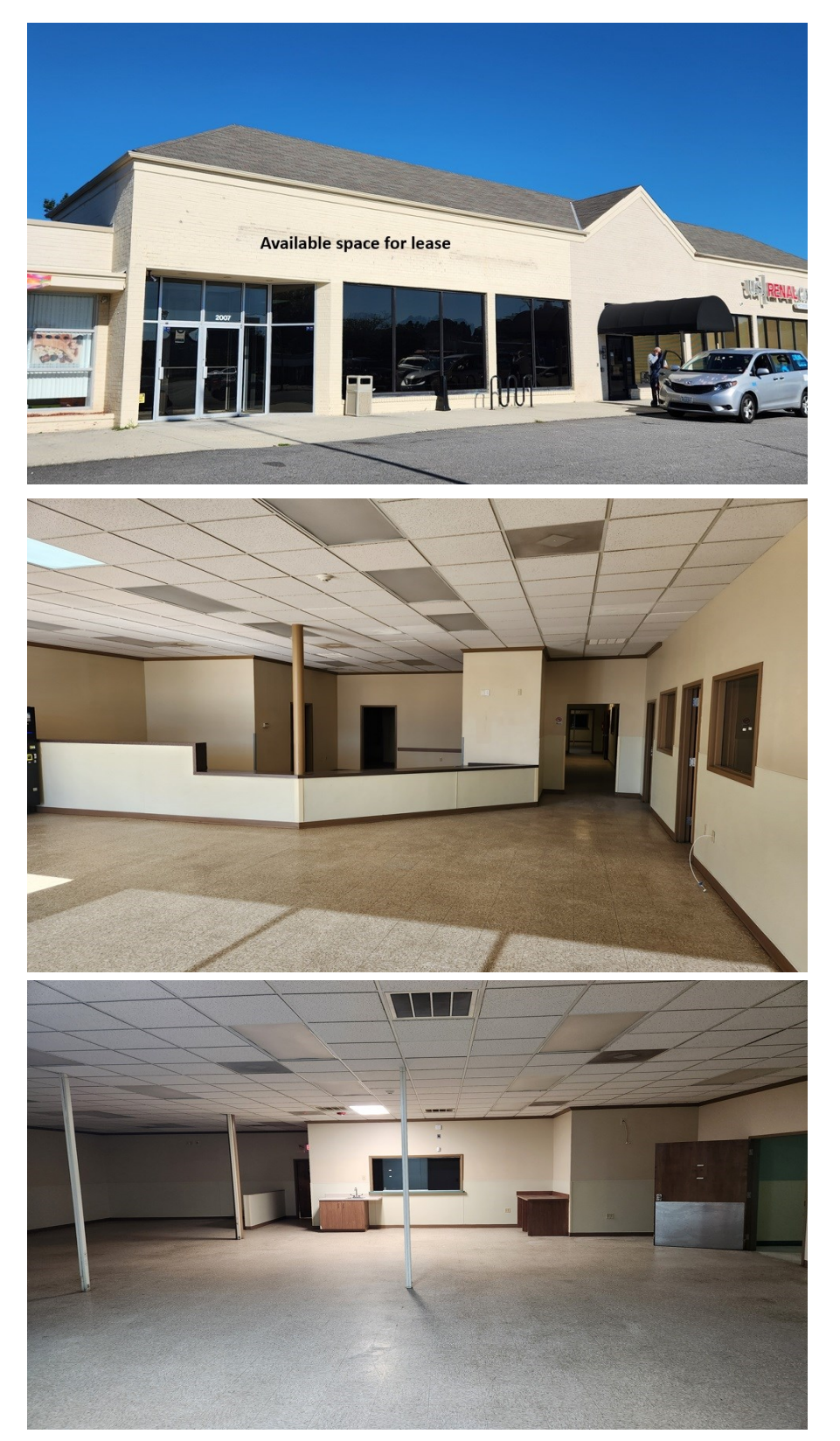
All information furnished to Specter Properties, Inc. is from sources judged to be reliable. However, no warranty or representation is made as to its accuracy or completeness. This applies to all pages within this document.